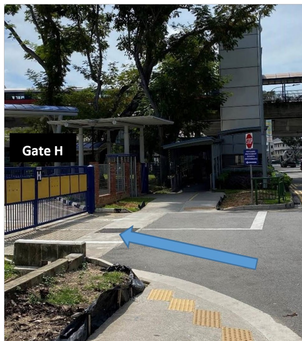
Geylang Methodist School (Secondary)

Drop off along Aljunied Road (Gate H) (Monday to Friday between 6.30 am to 7.30 am). Please be vigilant of pedestrians that will be walking along the pavement to/from Aljunied MRT.